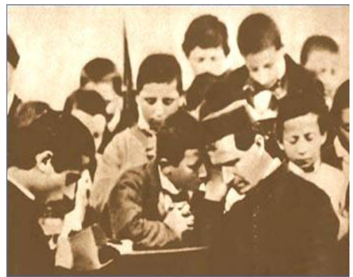
Don Bosco hearing confessions.

The problem, of course, was finding a place to meet. Fortunately, during the three years he was at the college, Don Bosco was allowed to use the courtyard, in spite of the noise and the liveliness of the meetings. After he finished his pastoral studies he had to search for another place. He became chaplain to an orphanage for young girls founded by a charitable noblewoman and was allowed to hold his meetings there in the courtyard. However, after eight months, the good woman could no longer endure the noise and, although Don Bosco still remained chaplain, he again had to find a meeting place where he could organize games and catechism classes and hear confessions.